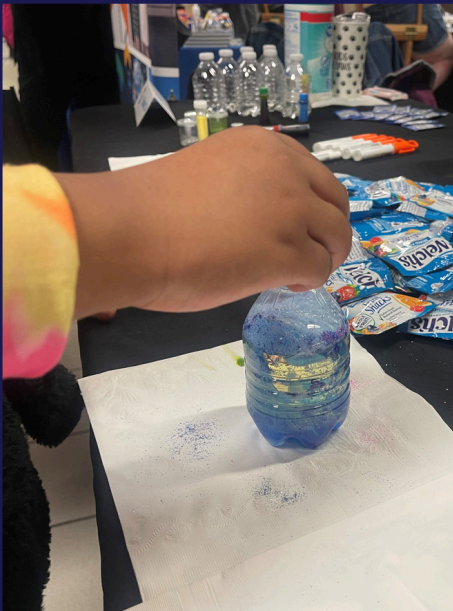
Photo of attendees participating in the Lava Lamp activity with WTS Atlanta Chapter members.