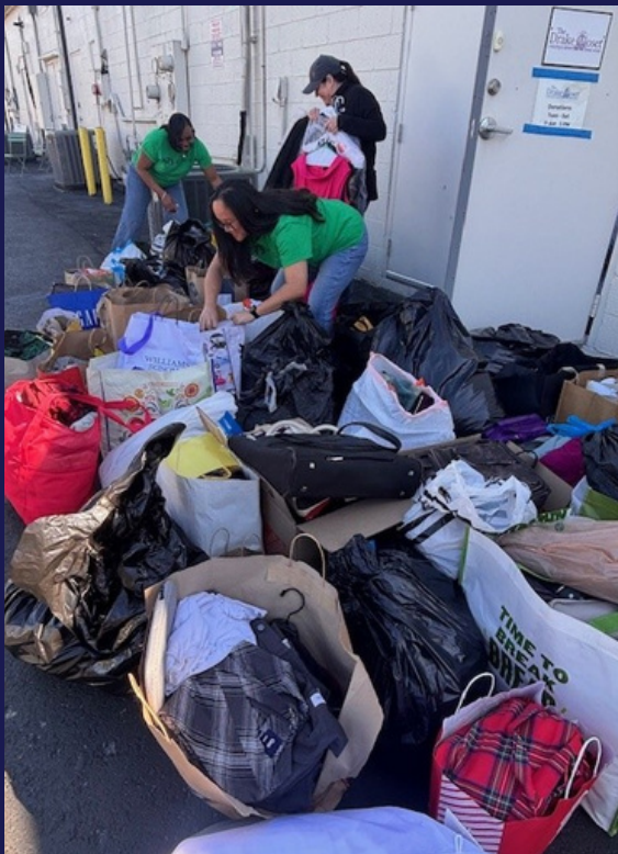
Photo of WTS Atlanta Chapter members with the Dress for Success donation boxes.

WTS Atlanta extends sincere appreciation to everyone who contributed to the success of this initiative and helped make a meaningful impact in our community.