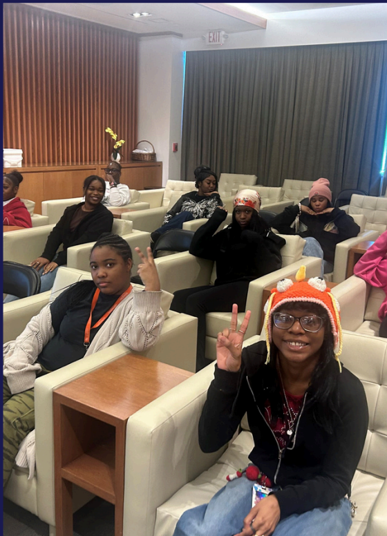
Photo of WTS Atlanta Transportation YOU students at the Kia tour.

W TS Atlanta TYOU embarked on a trip to LaGrange, GA on March 26th. We were on a mission to showcase careers at Kia Motors Manufacturing Georgia Plant! Students were able to sit in the newest car fleet of SUVs produced at that plant and learn about all the various employment opportunities at this state of the art facility. Additionally, students were offered guidance on the Four E's and know that it is okay to not have everything mapped out. Sometimes you will be prepared for education, and employment simultaneously but maybe not entrepreneurship for several years in the beginning phrases of your career journey.