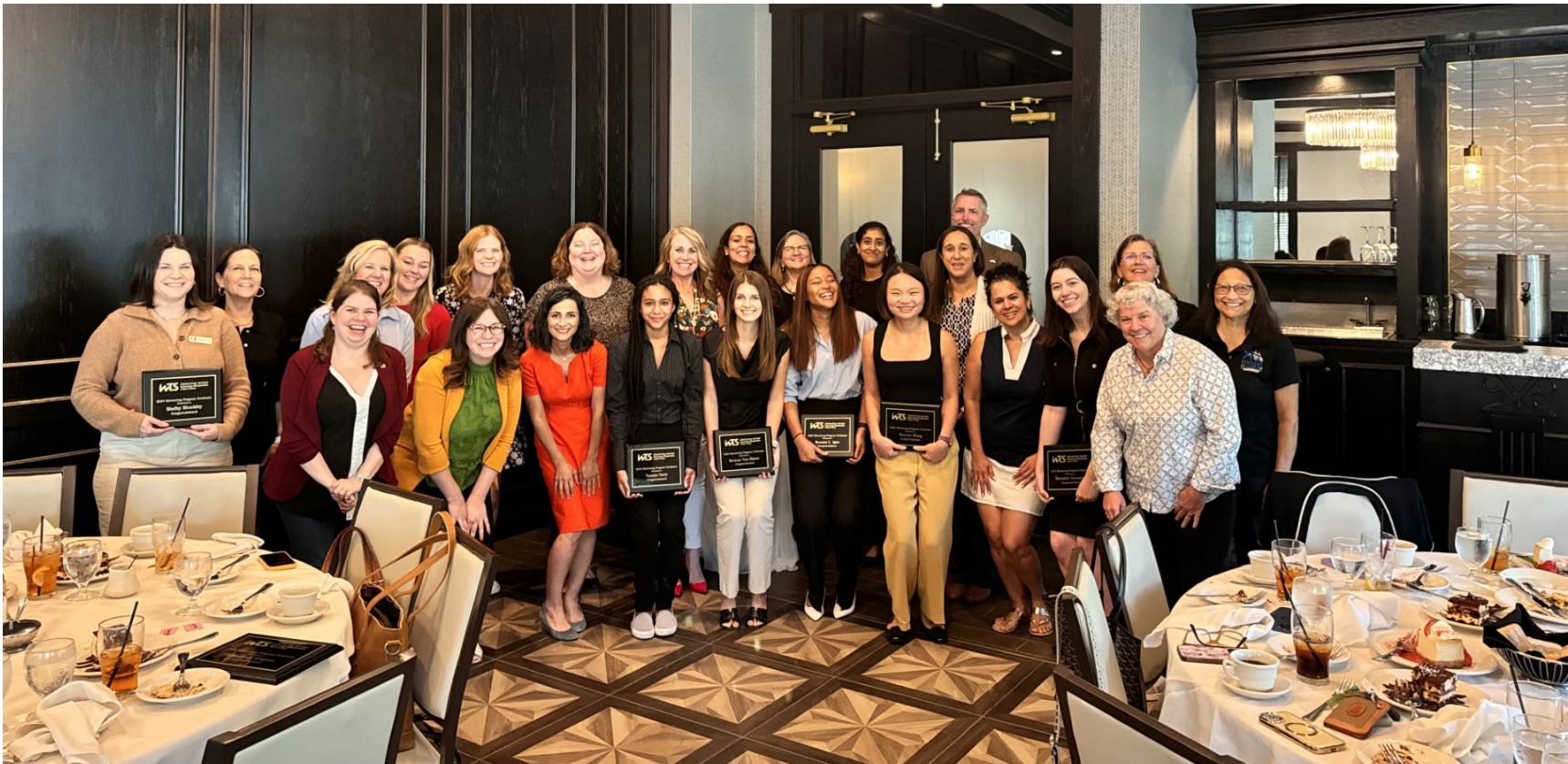
October 2024 Graduation Ceremony