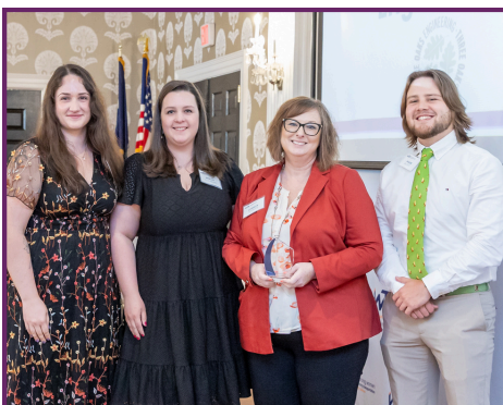
EMPLOYER OF THE YEAR Three Oaks Engineering