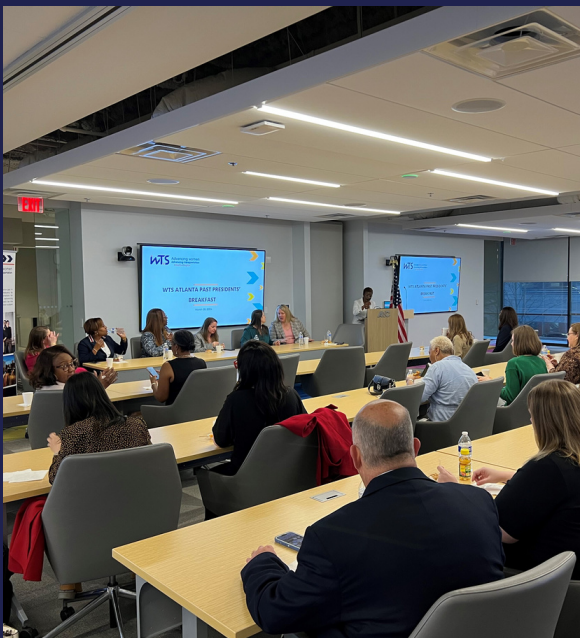
Photo (above): Panel discussion at Atlanta Regional Commission (ARC)

Some of the roads to presidency were intentional and others were more about seizing the opportunity. One common take-away from each President is they all volunteered and worked in multiple positions within the Chapter before becoming President, and sometimes even after being President. All benefited greatly as a result of their commitment and hard work in leading the Atlanta chapter. Benefits and lessons included leadership growth, expanded and diverse networks, enhanced confidence, and the power of women supporting women.