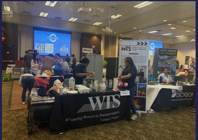
Photo (right): TU Committee members setting up “Make your Own Glue” activity