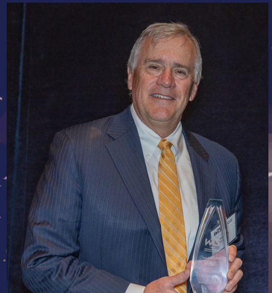
Diversity Leadership Award Atkins Realis