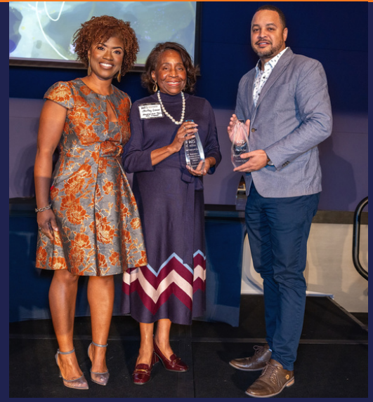
Employer of the Year Award Hartsfield Jackson Atlanta International Airport