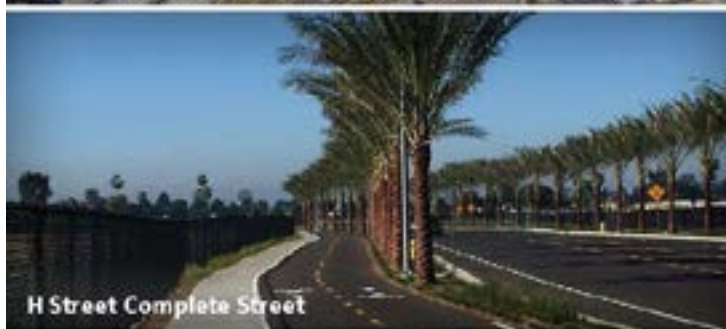
H Street Complete Street