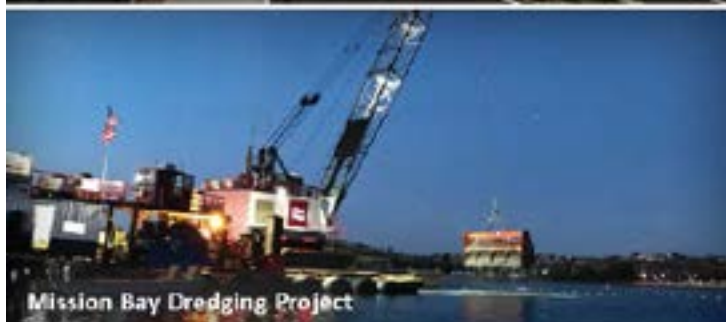
Mission Bay Dredging Project