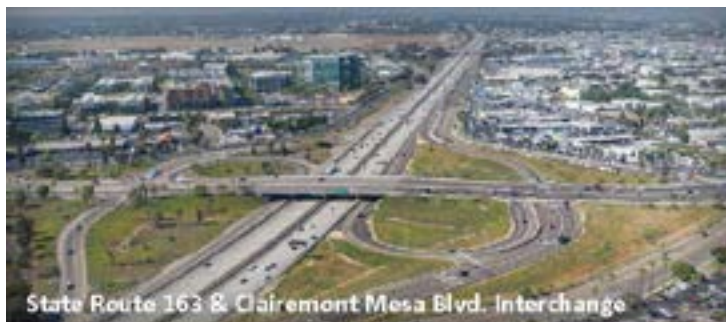
State Route 163 & Clairemont Mesa Blvd. Interchange