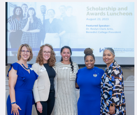
2023 WTS SC Scholarships & Awards Committee