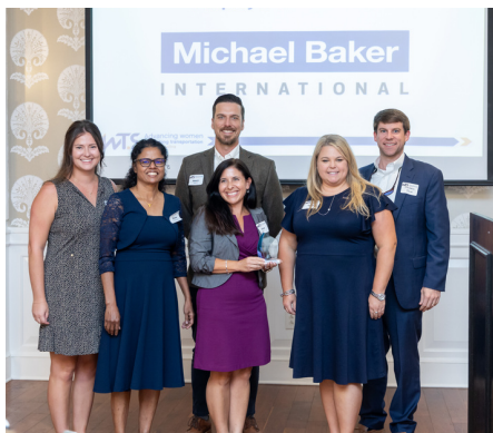
Employer of the Year Michael Baker International