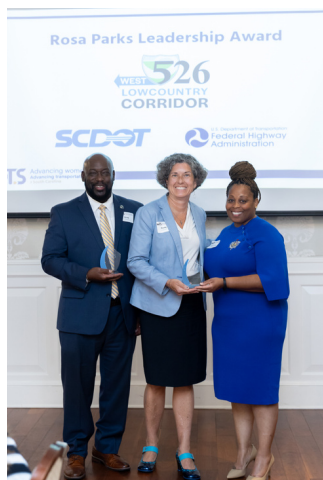
Rosa Parks Diversity Leadership Award I-526 Lowcountry Corridor Project, SCDOT/FHWA