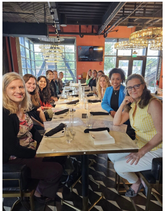
Mentors and Proteges meetup dinner

"I interviewed someone higher up in my company who I never would have had the opportunity to talk to about these topics. Now, when they come to my office, they make a point to say "Hi" to me – I have a relationship with senior leadership I never would have had without this experience."