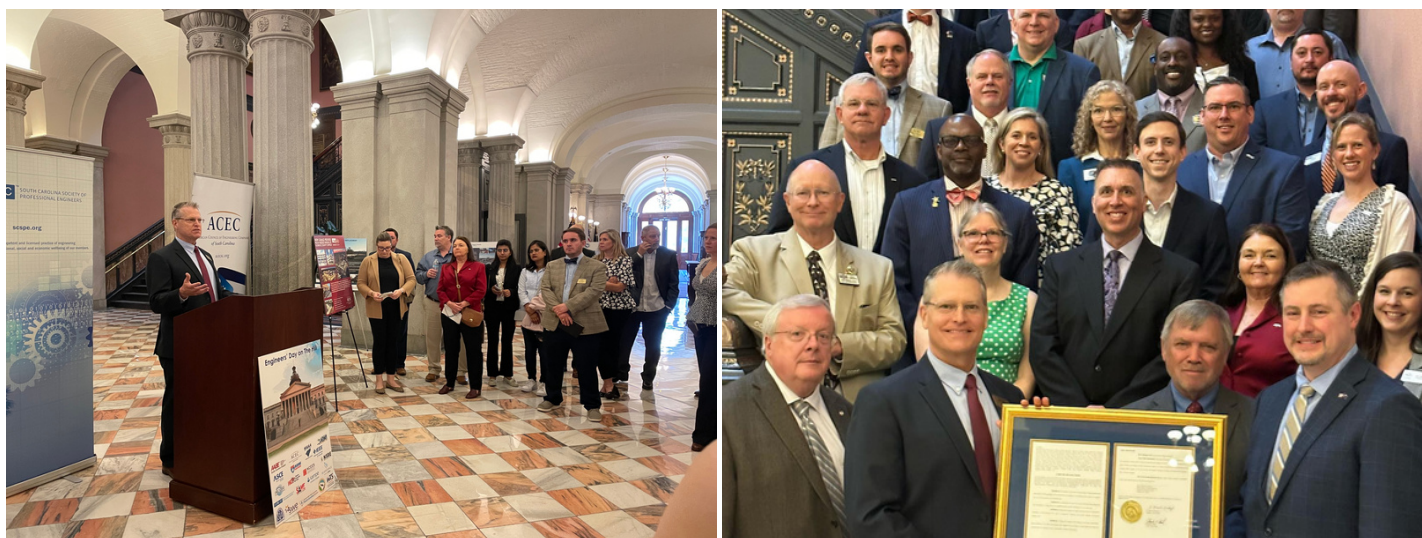
WTS SC Participates in Engineers' Day on the Hill in Columbia, SC

ACEC-SC & SCSPE are partnering with engineering associations across the state to host Engineers' Day on The Hill. The purpose of this day, in conjunction with Engineers' Week, is to educate legislators on the important and diverse roles that engineers play in our community and to increase our presence and voice in the public policy process. WTS SC had eight members and engineers from across the state gather at Engineers' Day on the Hill. Thank you to all who attended to promote our profession.