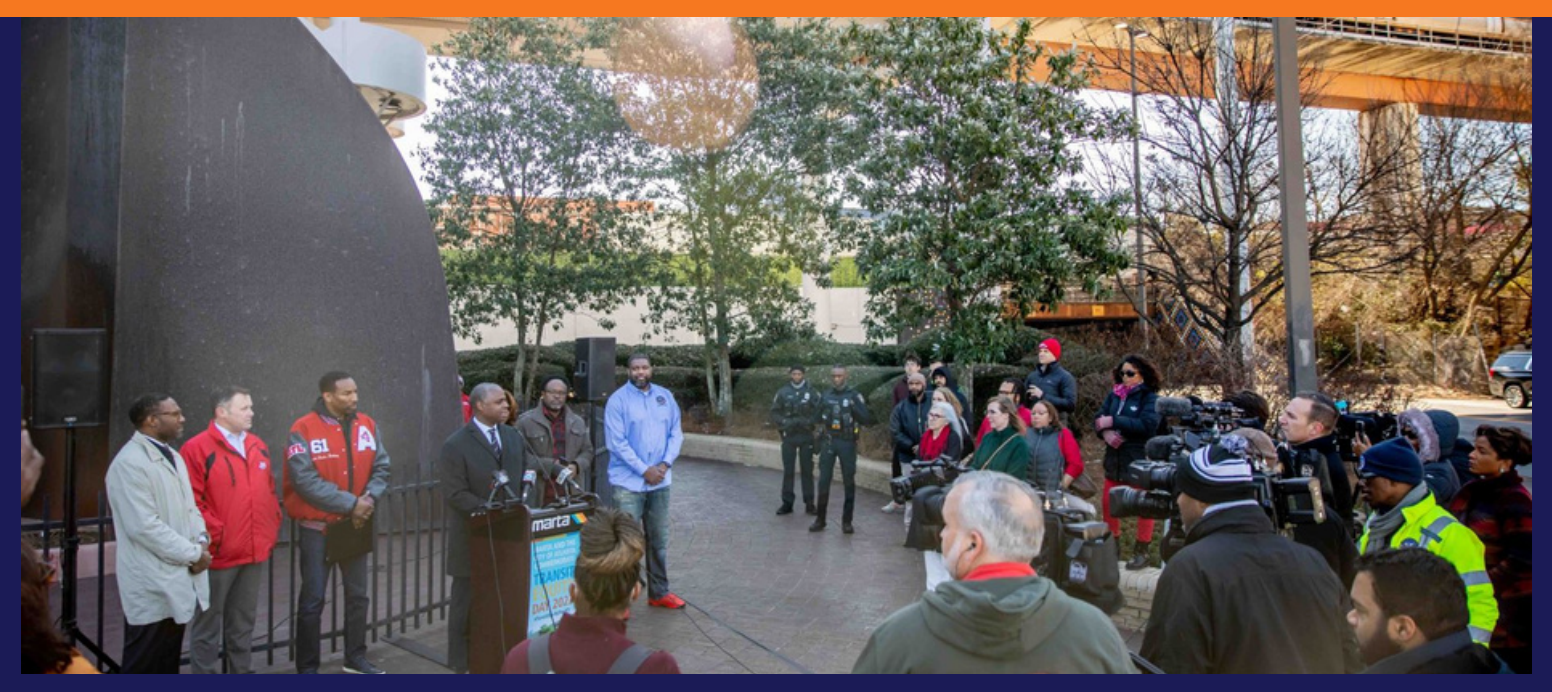
Photo (above): Community members gathering at MARTA's King Memorial Station for this year's Transit Equity Day.