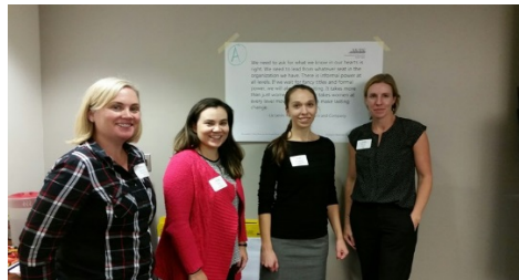
WTS-Boston Mentoring Committee