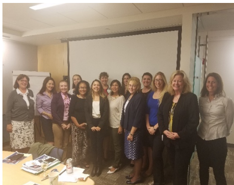
Ted Talk Discussion Group Photo