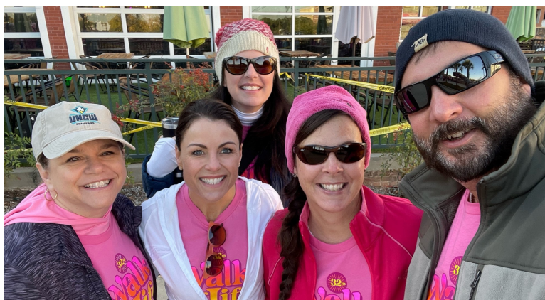
WTS SC Team Columbia Breast Cancer Walk

WTS SC hosted three teams for walks in October in support of Breast Cancer Awareness Month! Members and non-members were invited to come out to walk with the WTS SC teams at the Making Strides Against Breast Cancer events in Greenville and Charleston and the Walk for Life & Famously Hot Pink 5K & Half Marathon in Columbia, then meet up post-race. Thank you to those who joined our teams!