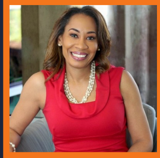
Transit Division Manager Cobb County Department of Transportation