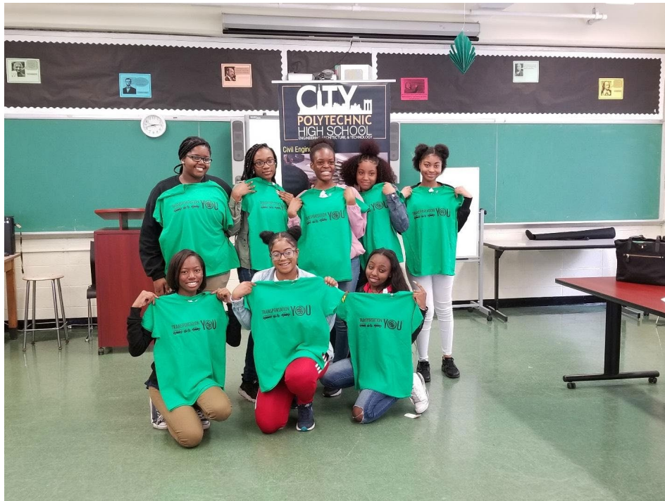
WTS GNY Transportation YOU NY Program 2017-2018 Graduation