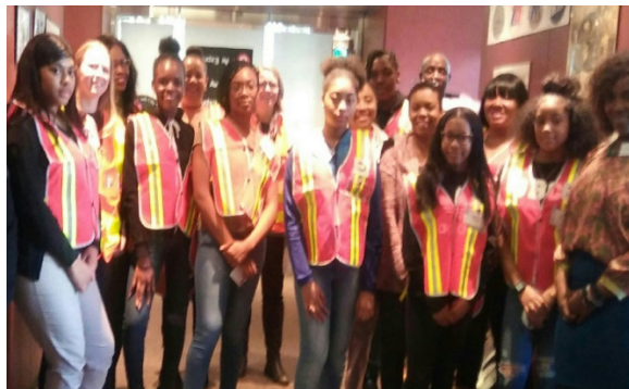
MTA NYCT Subway Simulator