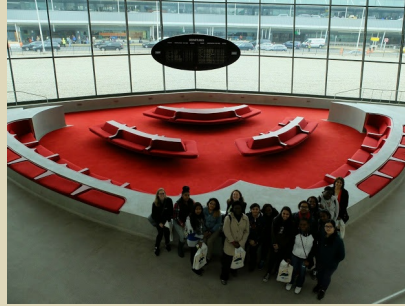
Transportation YOU group inside the historic Trans World flight center