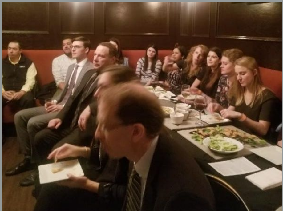
To view more photos from this event, <u>click here</u>.