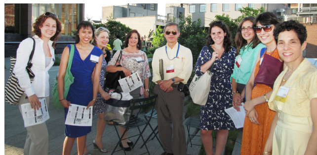
WTS-GNY members taking a walking tour of the High Line at the Spring Fling.