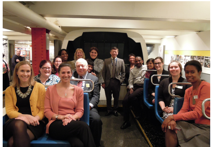
Last stop – WTS-GNY Mentor Program graduation December 12th at the Transit Museum.