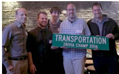
The winning team at the Transportation Trivia Night event was The #Feltsociety.