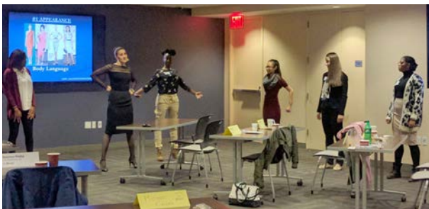
Students from the NY Transportation YOU Program learning power poses.