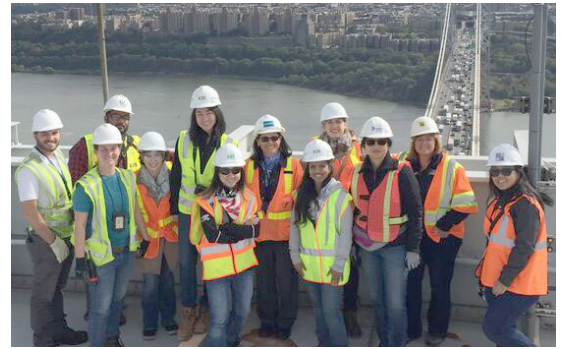
George Washington Bridge Tour in October.