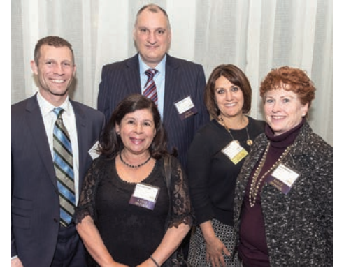
Employees of Jacobs

interns in the New York and New Jersey region have been women. The firm also maintains Co-Op students who work in