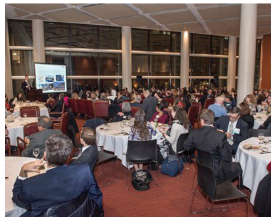
New York Fall Dinner.