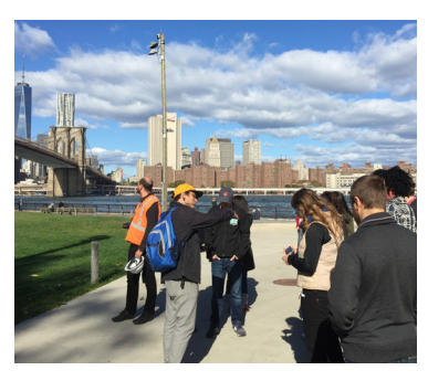
Tour guides discussing the Brooklyn Bridge in September.

Holiday Party at Trinity Place in Lower Manhattan