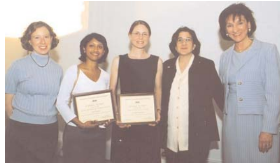
2002 WTS Scholarship Fundraising Reception