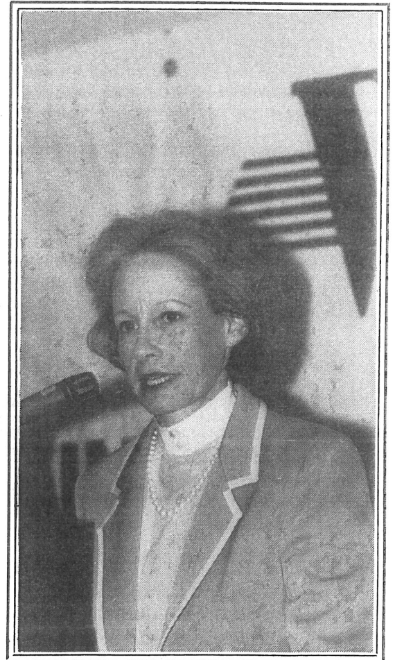
The Honorable Nancy L. Kassebaum, U.S. Senate. ▶