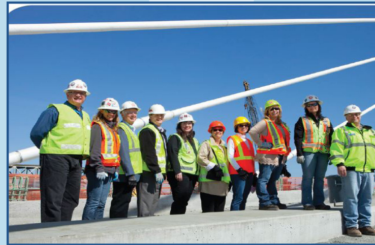
TriMet Orange Line Light Rail Extension, Project of the Year award