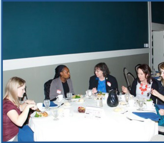
Members and Guests at the 2015 October Luncheon