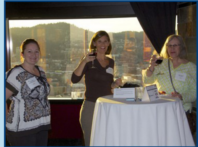
2015 Membership Meeting