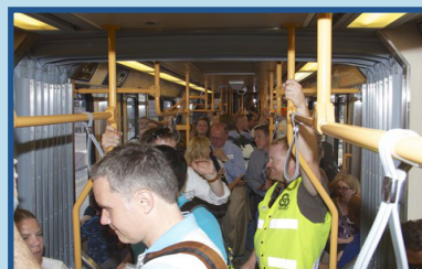
MAX Orange Line Preview Ride