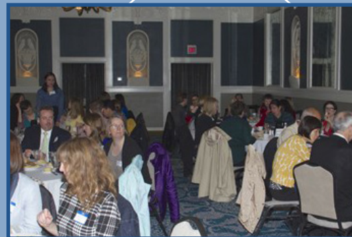
Full house at the March 2015 Panel on Bus Rapid Transit