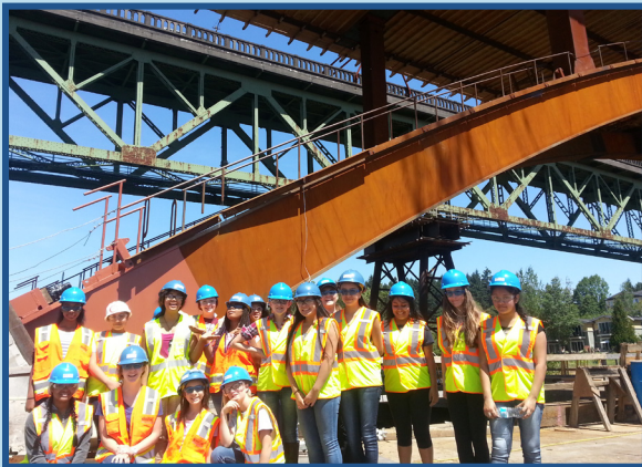
Multnomah County provided a behind the scenes tour of the construction of the Sellwood Bridge.

Our partnership with Girls Inc. continues now into the summer with their EUREKA! Program. The Girls Inc. program works with cohorts of girls from 8th grade through high school with the aim of exposing girls to STEM related opportunities and supporting them in pursuing STEM related education and career choices. WTS volunteers have attended EUREKA! sessions to share personal experiences from college and careers. Our volunteers have also arranged and led field trips for the girls. In summer 2015, WTS Portland hosted two outdoor excursions.