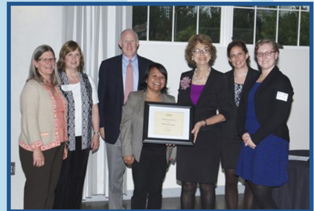
Multnomah County accepting Employer of the Year

The County participates in two internship programs: College to County and the Summer Youth Program. Both of these programs provide opportunities to introduce high school and college students to a career in the public sector. Positions are carefully chosen to meet the skills and interests of students providing a 6-8 week internship. The purpose of