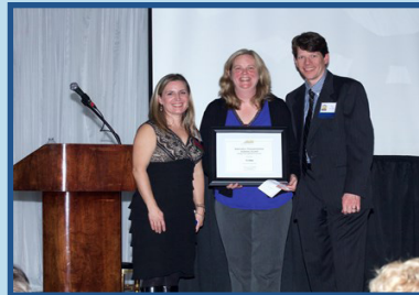
WTS Winter Gala

The Innovative Transportation Solution Award (formerly known as the Project of the Year) recognizes a project led by a woman that has been particularly innovative from initiation to completion. The awardee can be an initiative, solution, project or policy that met and overcame challenges to achieve its purpose.