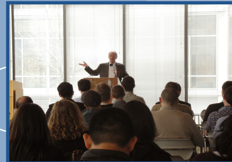
WTS PSU Event