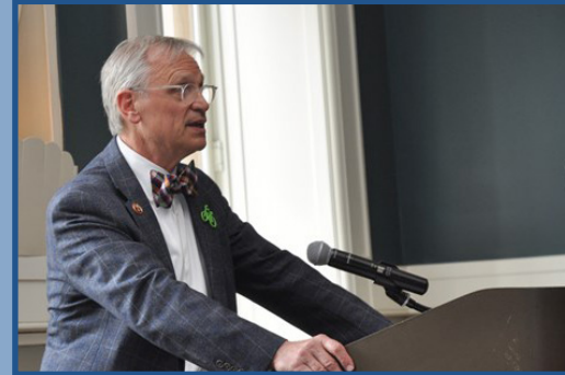
Bonus May 2015 Luncheon speaker: Congressman Earl Blumenauer