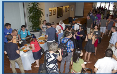
MAX Orange Line Preview Ride