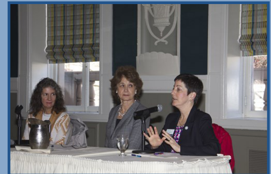
Panel discussion on Women in Politics in February 2015