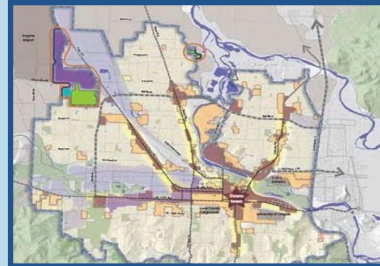
Envision Eugene/Moving Ahead Event