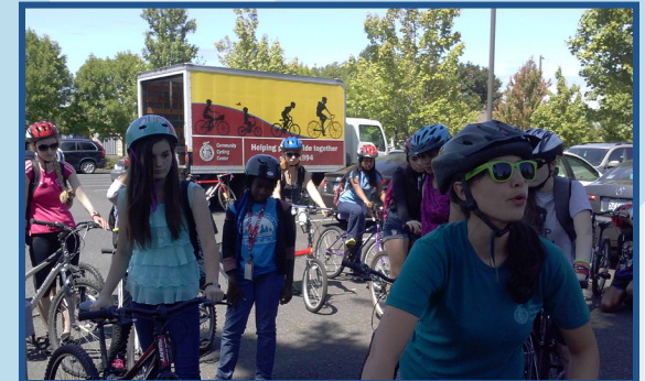
Approximately twenty girls participated on a guided bike ride with the Community Cycling Center and WTS volunteers in N/NE Portland.