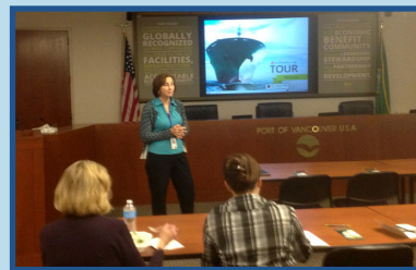
Port of Vancouver Tour

The Networking Happy Hour was a huge success! We had WTS members from both private companies and public agencies attend the happy hour last week. It was a great opportunity to meet and network with other Vancouverites and even some interested members from Oregon.