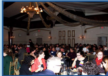
WTS Winter Gala