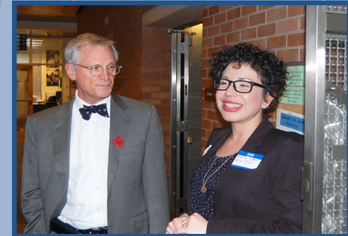
WTS PSU Event

In 2016, WTS PSU has plans to host two additional socials and recruitment events, and are exploring ways to launch a shadowing program that connects students with WTS professionals for a day. At the beginning of the 2016 spring term, the group will open nominations and select new board members for 2016-2017 term.