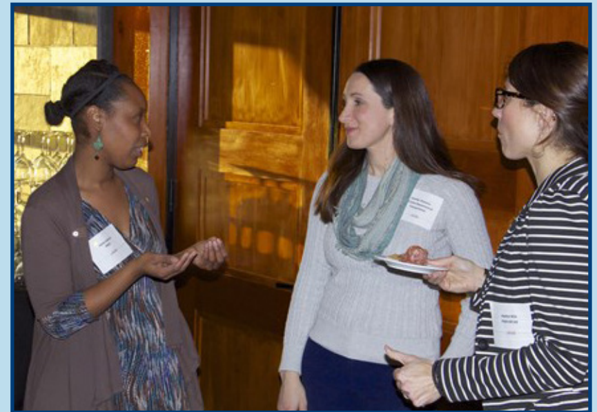
2015 Membership Meeting