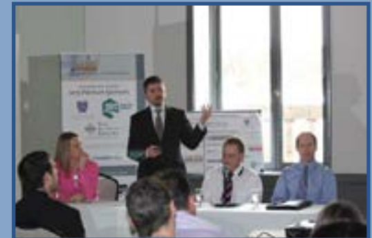
WTS March 2014 Traffic Technology Panel