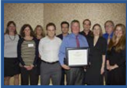
Project team accepting Innovative Transportation Solutions Award

The internal decision-making process involved many ODOT teams, including project development, information technology, construction, public affairs, community affairs, and planning. The work included installation of new sign bridges, installation of advisory speed signs and