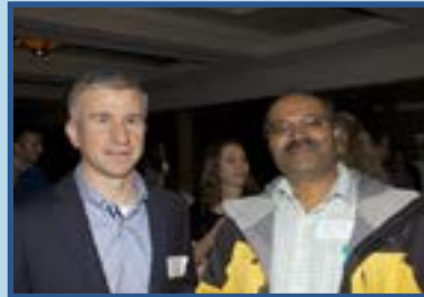
WTS Winter Gala