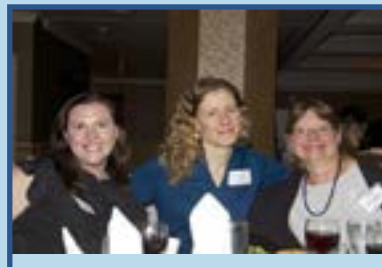
WTS Winter Gala