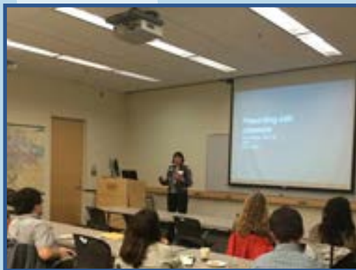
Presenting with Presence, October 2014