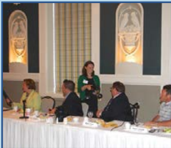
September 2014 Mayoral Panel