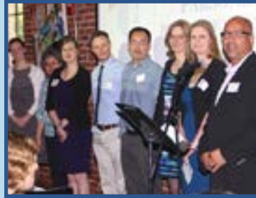
Parsons Brinckerhoff accepting Employer of the Year

group manager, structural engineering group manager, marketing manager, local project operations manager, principal area manager, and numerous project managers. Several of these individuals are also designated officers of the company.