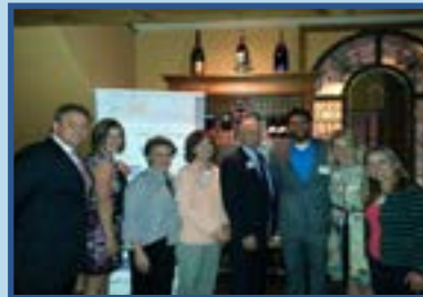
Oregon Transportation Commission Reception