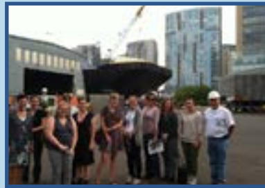
Zidell Marine Barge Tour