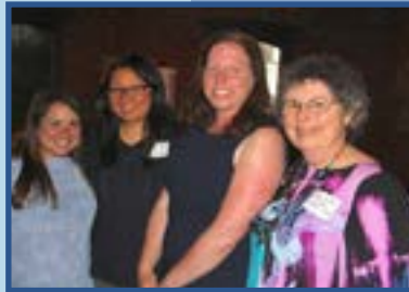
WTS Spring Awards