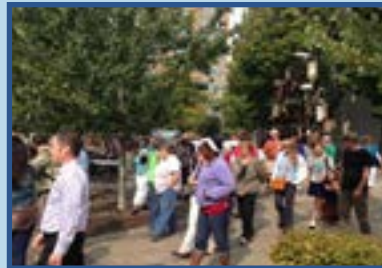
Downtown Vancouver Walking Tour

WTS efforts in Vancouver to the greater community, while learning more about Vancouver's murals as well as the recent and ongoing revitalization efforts of the downtown area.