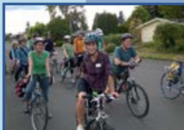
Pedalpalooza: Reverse Commute