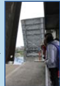
Morrison Bridge tour