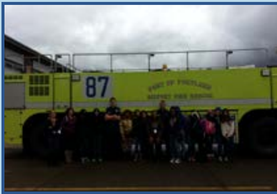
Port of Portland's Airport Fire station

opportunity to tour the full Portland International Airport runway and visit with emergency responders at the fire station. The stop at the station included an extensive tour of the different equipment used to battle fires and included a live water spray demonstration of one of the trucks. At the FedEx facility, girls toured the airport facility learning about freight movement and the process of receiving, packing and distributing packages by air and truck.