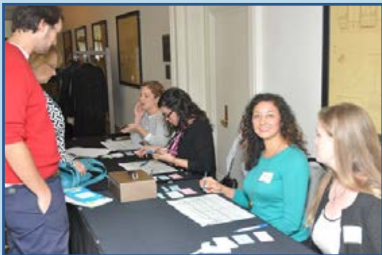
WTS Luncheons Committee Volunteers at the October 2014 Luncheon