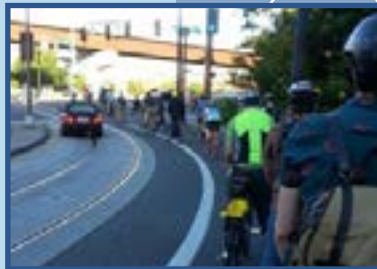
Pedalpalooza: WTS Signal Wonkery