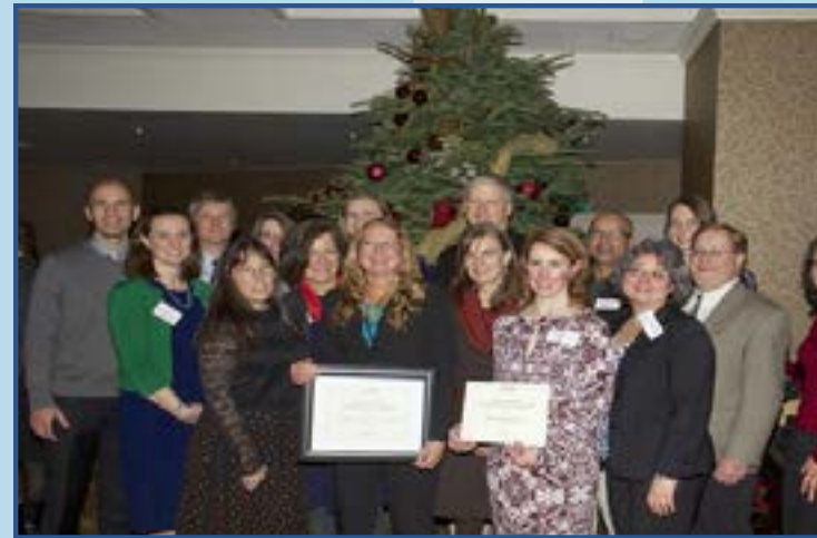
Project team accepting Project of the Year award

The purpose of the US 97 Bend North Corridor EIS Project is to improve safety and mobility, alleviate congestion, and facilitate traffic flow for trucks and automobiles traveling on US 97 by implementing a practical design solution. Within the project area, US 97 currently serves both through and local traffic. In addition, the corridor includes many access points onto US 97, which results in congestion and contributes to the many rear-end, severe injury and even fatal crashes. To address these issues, the two alternatives that ODOT initially considered in the Draft EIS included a new interchange north of the City of Bend's urban growth boundary (UGB). While these alternatives met the project's needs, they would have introduced new roads and additional traffic to a rural residential neighborhood and would have required exceptions to Oregon's Statewide Planning Goals. During the 45-day public comment period on the Draft EIS, ODOT received 166 comment submittals (letters, public hearing testimony and forms, and e-mails) from agencies and the public. Many of these comments requested that ODOT look for solutions with fewer impacts to nearby residents. In response to comments on the Draft EIS, ODOT explored opportunities to reduce and/or mitigate