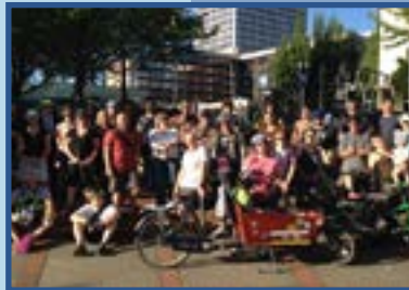
Pedalpalooza: WTS Signal Wonkery