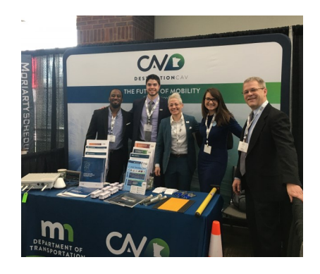
Innovative Transportation Solutions—MN CAV Challenge