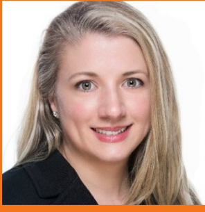
Bridgette Beato Lumenor Consulting Group