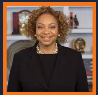
Henry County Board of Commissioners