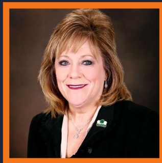
Forsyth County Board of Commissioners