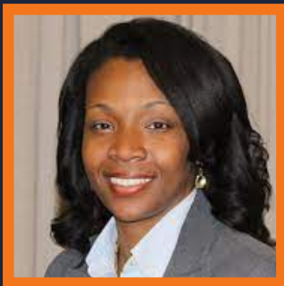
Cobb County Board of Commissioners