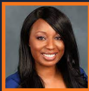
Gwinnett County Board of Commissioners