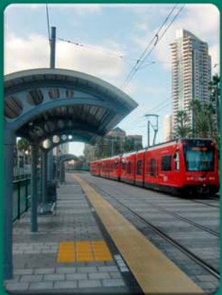
Green Line Extension, Downtown & Orange Line Low Floor Stations Project