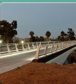
Mike Gotch Memorial Bridge

Completed in April 2012, the structure is a remarkable clear span bridge over Rose Creek. It completes the missing link in the existing regional bicycle network. The bridge incorporates innovative engineering design concepts to protect the surrounding natural environment.