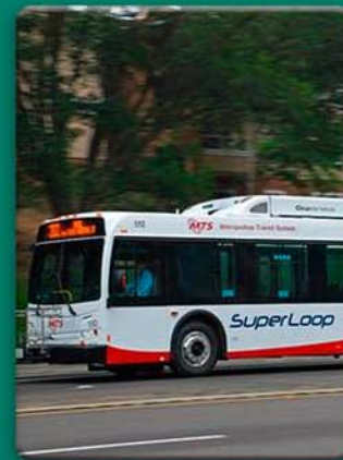
Superloop (Bus Rapid Transit)