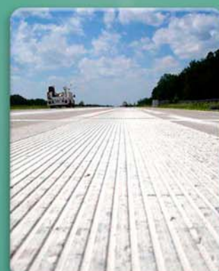
Next Generation Concrete Surfaces (NGCS)

As part of an ongoing commitment to explore opportunities to reduce freeway noise, District 11 conducted a pilot project along a one-mile stretch of Interstate 5. The project used new technology and is the first new concrete pavement texture introduced in the last 20 to 30 years.