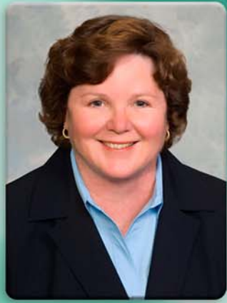
Mayor Cheryl Cox City of Chula Vista

Mayor Cox is a tireless advocate for the redevelopment and revitalization of Chula Vista. Her efforts place emphasis on transportation infrastructure, including smart growth planning and the South Bay Bus Rapid Transit project, which connects downtown San Diego, Chula Vista and South Bay with convenient transit options.