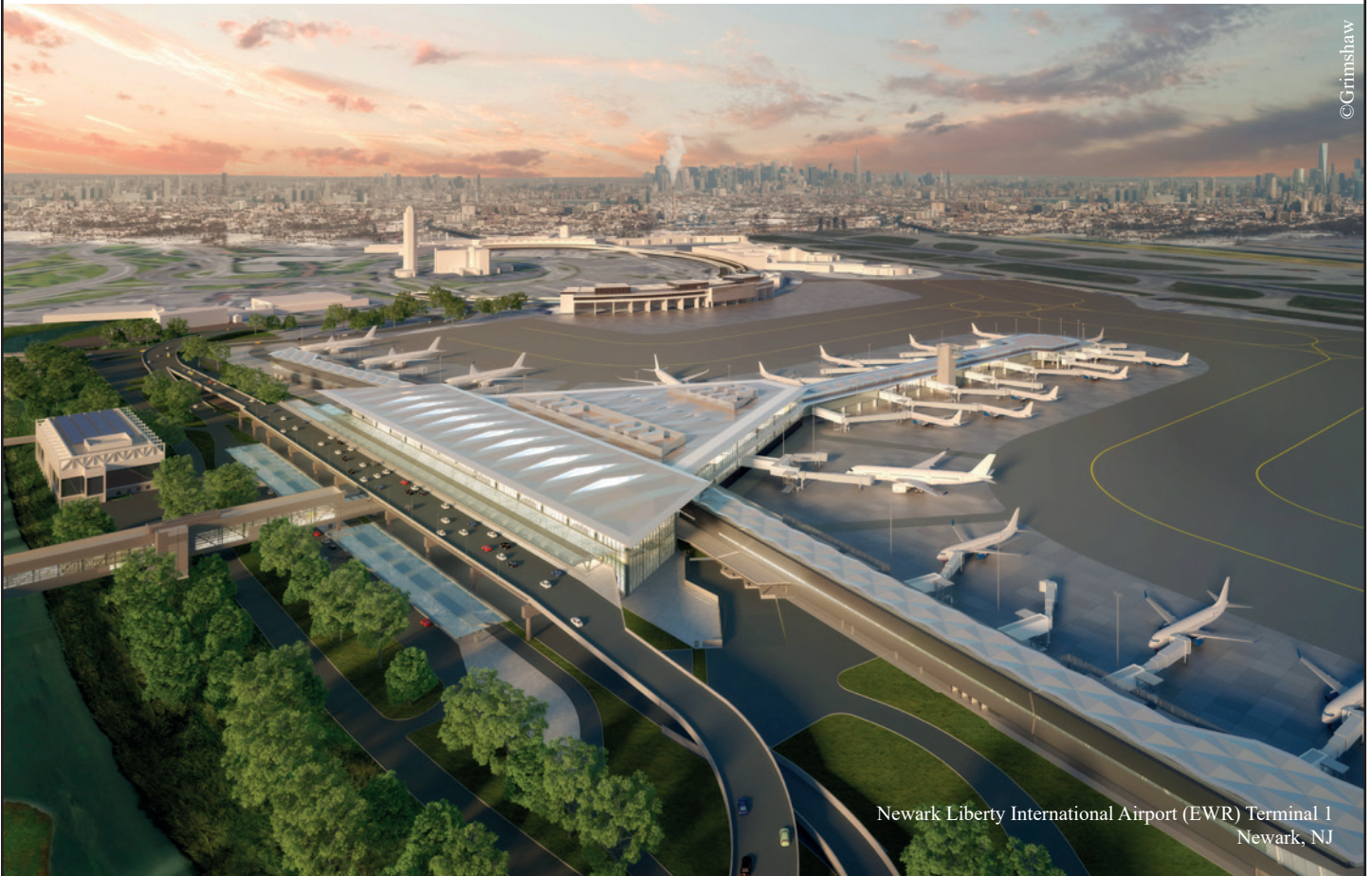
Newark Liberty International Airport (EWR) Terminal 1 Newark, NJ