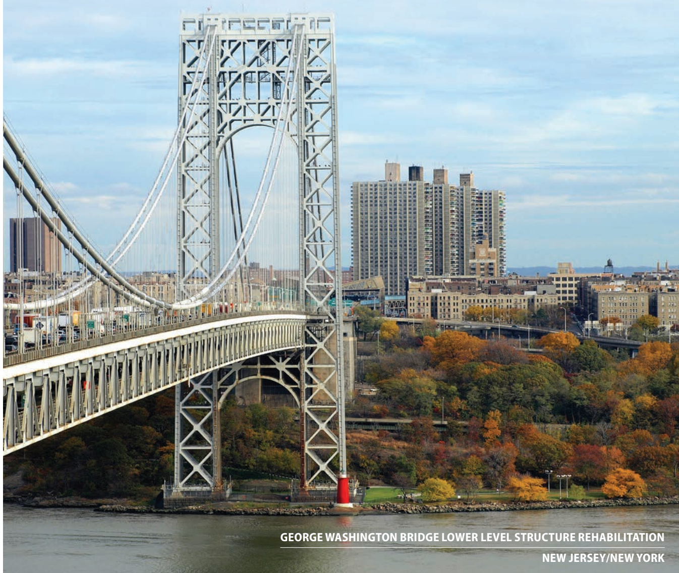
GEORGE WASHINGTON BRIDGE LOWER LEVEL STRUCTURE REHABILITATION NEW JERSEY/NEW YORK

DIRECTOR OF RAIL TRANSIT AND GENERAL MANAGER OF PATH, PANYNJ