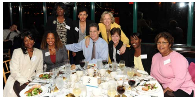
Members of NJ Transit enjoying the dinner.