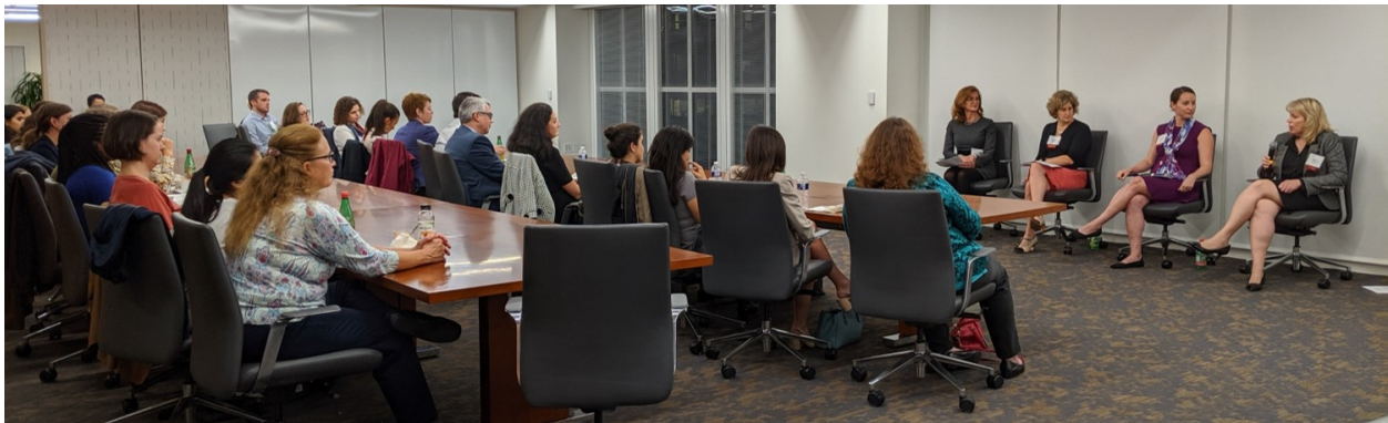
Figure 17 – A full room attending the "Leading Across Generations" panel.

The last event of the year was hosted with the Mentoring Committee and was held at the APTA offices. The event titled "Leading Across Generations" brought together a panel of managers who discussed their tried and tested methods and manners on working with people from different generations.