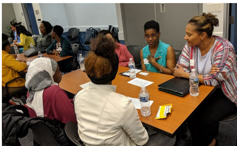
Figure 18 – Annual Speed Mentoring event where transportation professionals spend a few minutes talking to several students.

Professional development activities led by the Transportation YOU Committee included a speed mentoring session and field trip to Virginia DOT Traffic Control Center. The students were also introduced to mission statements and resume writing through our spotlight speaker series. WTS volunteers across the DC Chapter have been recruited to serve as speakers and lend a hand through all our professional development activities. Field trips in 2019 included a trip to the Center for Advanced Transportation Technology at the University of Maryland and to the District Department of Transportation. Our commitment to exposing our young ladies to the transportation field is made evident by the commitment of our committee in addition to the various WTS-DC members who volunteer to speak and organize/host events for our mentees.