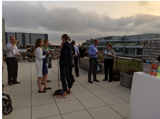
Figure 13 – Membership Mixer