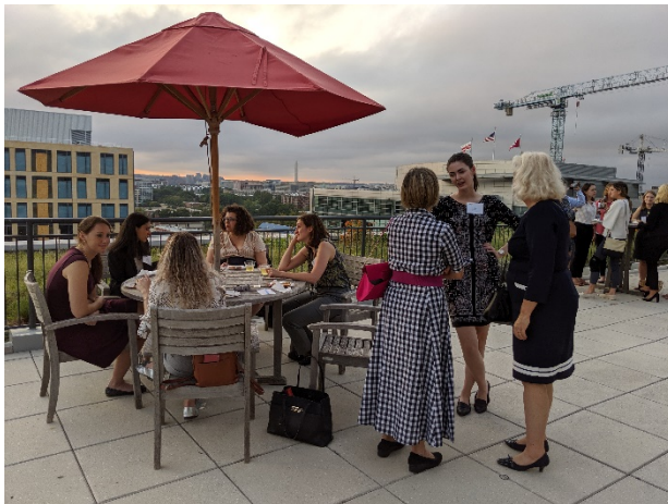
Figure 12 – Membership Mixer

WTS-DC Chapter membership remained relatively constant throughout 2019 with the average member count hovering around 234.