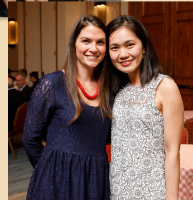
2019 WTS Houston Scholarship & Awards Gala