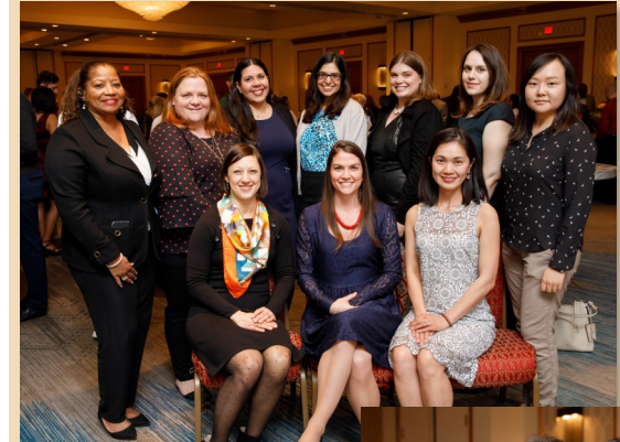
2019 Young Engineer of the Year Event

As I approach the end of my term as WTS Houston's Chapter President I cannot help but feel grateful. Grateful for our sponsors that have helped us to award $20,000 dollars in scholarships for women seeking careers in transportation and the life changing impact of our scholarships for these women. Grateful for our volunteers that have helped us lead our professional development, STEM, and numerous other development programs over the past year. But mostly I'm grateful for the relationships I have developed and leadership and growth opportunities I have experienced from being a part of WTS over the past 10 years. I hope that you enjoy this year's annual report and that it will inspire you to not only continue to support this amazing organization but actively join us in all that our Chapter has to offer.