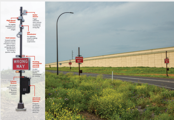
CTRMA Wrong Way Driving