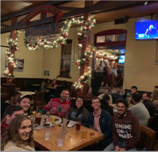
FAREWELL HAPPY HOUR

Students from across both the WTS and ITE/ITS chapters gathered together to celebrate the holidays by enjoying great food. Hosted at a WTS Member’s home.