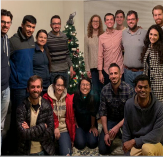
HOLIDAY POTLUCK PARTY

Students from across both the WTS and ITE/ITS chapters gathered together to celebrate the holidays by enjoying great food. Hosted at a WTS Member’s home.