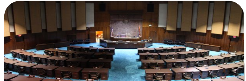
House – 60 Members