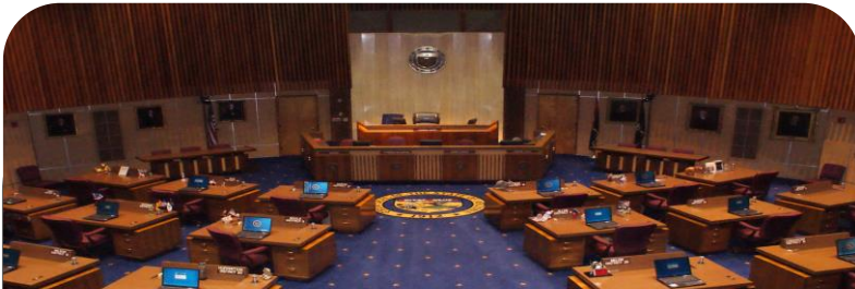
Senate – 30 Members