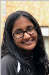
Last year’s winners.

It’s that time of year again! Friends of WTS Scholarship for high school students will be posted in January and will be due March 6, 2020; check our website for updates.