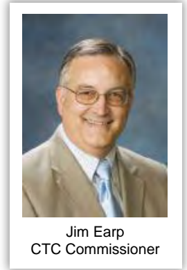
Jim Earp CTC Commissioner

WTS Sacramento thanks Commissioner Jim Earp for his dedication and hard work for the transportation industry.