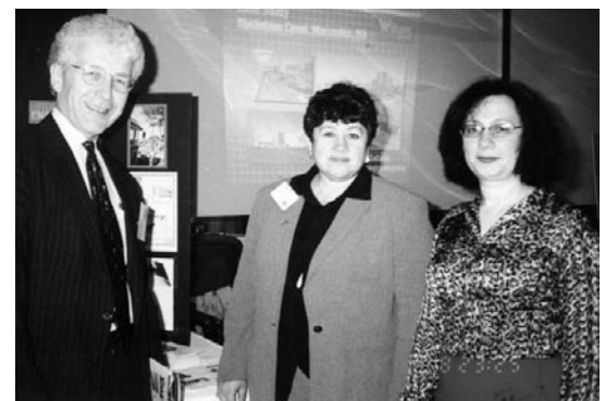
Exhibitors present their material.