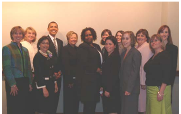
The 2005 WTS Board of Directors with then-U.S. Senator, now President Barack Obama.

We hope that President Obama's connection to WTS will continue as he paves the way for the future of transportation in the U.S.