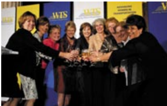
WTS International Past Presidents toast to the future of WTS.