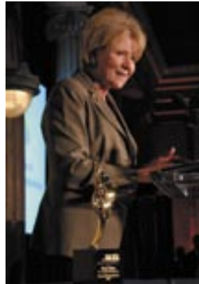
US Secretary of Transportation Mary Peters is the first recipient of the Lifetime Achievement Award.

Peters, touched by the presentation and the