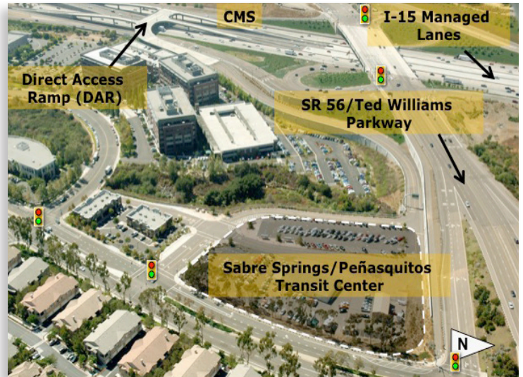
I-15 corridor and surrounding multimodal transportation system.

In 2010, the Interstate 15 (I-15) corridor was selected as one of two pilot sites in the nation to test the ICM concept. As part of this project, a unified traffic management system will be created for the corridor, enabling an unprecedented level of multi-agency and multimodal coordination to achieve smooth traffic flow. The project covers a 20-mile section of I-15 from just north of State Route 52 (SR 52) in the City of San Diego to State Route 78 (SR 78) in the City of Escondido, including the state-of-the-art managed Express Lanes facility within the freeway median and major arterial routes within a few miles to the east and west of I-15.