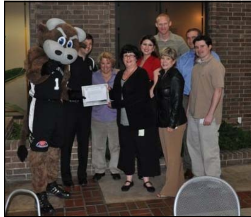
The Austin Toros mascot and WTS-HOT Chapter attendees.

WTS members, along with friends and family, watched the Austin Toros take on the Detroit Pistons - affiliated Fort Wayne Mad Ants.