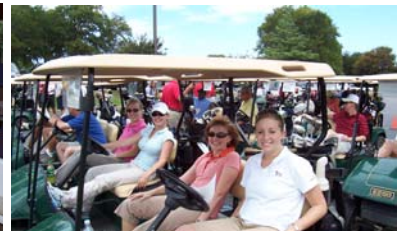
Snapshots from around the 2007 Golf Tournament